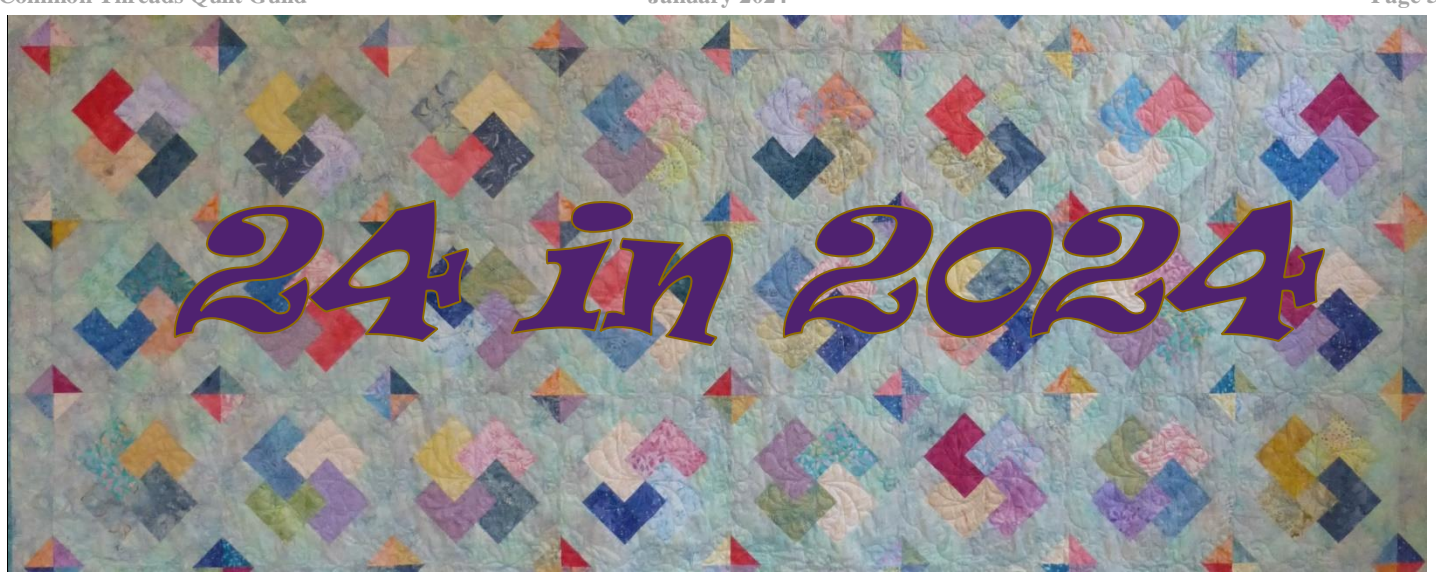
That is 24 Finishes in 2024!

Join in the fun and make 24 quilted projects by the end of 2024 and your name will be entered into a special drawing held in December 2024. If you'd like to participate, fill in your name and 24 projects you'd like to finish this year on the list below. This is your list...you can add to it throughout the year if need be to have 24 projects or you can remove a project, or swap out projects, etc...you just have to have 24 Finishes in 2024 AND you must show each project at one of the guild's monthly show and tell. You can show multiple projects in one month. You also don't have to show a project every month, you just have to have 24 Finishes in 2024 You will maintain your own list, but you must let Sharon Perry know you are participating.